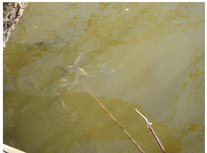
A small school of alewives spawn in the murky waters of a Quinnipiac River backwater called Rice's Pond in North Haven.