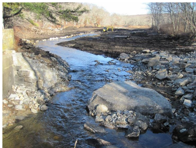
The East Branch Eightmile River with the dam gone. Remnants of the stone dam can be seen at the left side of the photo. The boulder on which water was splashing remains in the middle of the photo.